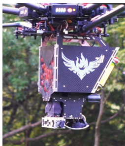
Ignis 2 flying on M600 Pro